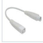
424020003 CONNECTION PLUG 150 RGL LEDECO