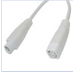
424020005 CONN PLUG 1.5MT RGL LEDECO