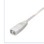
424020006 MAIN POWER L1500 REGLED ECO