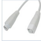
424020009 CONNECTION PLUG 2MT RGL LEDECO