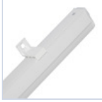
424020004 GR ACCESSORY RGL LEDECO