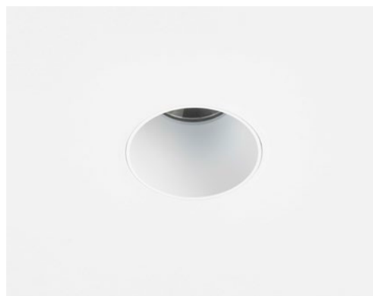
CODE: 1392001 FINISH: MATT WHITE

TO MAINTAIN THIS PRODUCT TO ITS BEST CONDITION, PLEASE VIEW OUR CARE AND CLEANING GUIDE ON THE SUPPORT SECTION OF THE ASTRO WEBSITE.