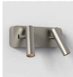
CODE: 1058195 FINISH: MATT NICKEL