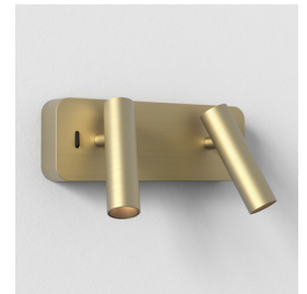
CODE: 1058196 FINISH: MATT GOLD