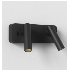
CODE: 1058192 FINISH: MATT BLACK