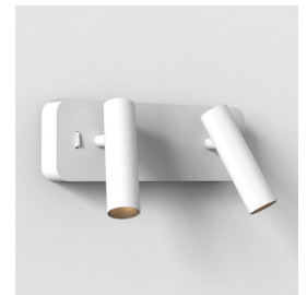
CODE: 1058194 FINISH: MATT WHITE