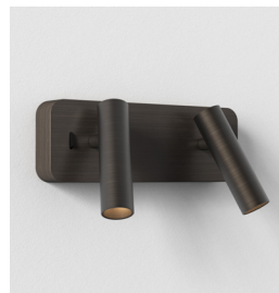
CODE: 1058197 FINISH: BRONZE

TO MAINTAIN THIS PRODUCT TO ITS BEST CONDITION, PLEASE VIEW OUR CARE AND CLEANING GUIDE ON THE SUPPORT SECTION OF THE ASTRO WEBSITE.